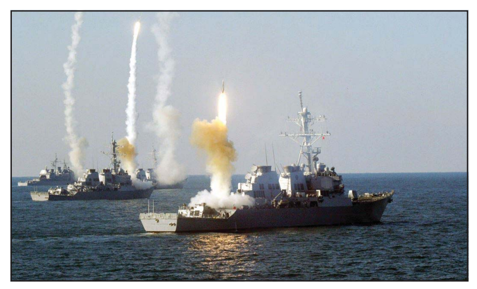
April 2017: American warships fire Tomahawk missiles on a Syrian airbase in retaliation for chemical attacks on their own people.

Gallium is needed for cellphones and radar systems. Niobium, maganese, titanium, tungsten, vanadium, strontium, chromium, zirconium and hafnium are just some of the critical minerals needed by our defense and aerospace industries to create lightweight and heat-resistant compo-