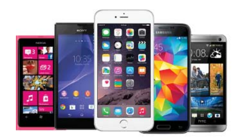
Smartphones require copper, silver, gold, palladium, platinum, tantalum, neodymium, indium and yttrium.

Cobalt is a required alloy for aircraft engines, electronic devices,