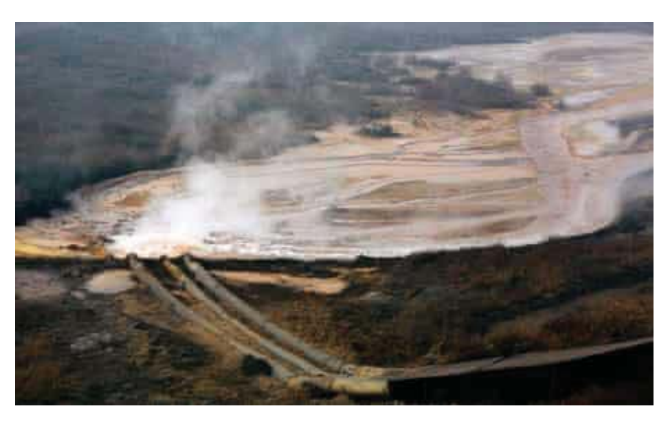
Pipes coming from a rare-earth smelting plant spew into a tailings dam on the outskirts of Baotou in China's Inner Mongolia autonomous region.

From the air it looks like a huge lake, fed by many tributaries, but on the ground it turns out to be a murky expanse of water, in which no fish or algae can survive. The shore is coated with a black crust, so thick you can walk on it. Into this huge, 10 sq km tailings pond nearby factories discharge water loaded with chemicals