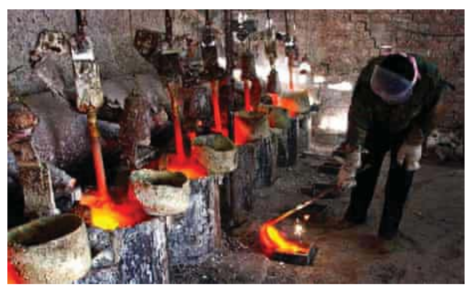
A worker pours rare earth metal lanthanum into a mould near the town of Damao, in China's Inner Mongolia Autonomous Region.

Even as America tightens emission standards, the fast-growing economies of Asia are filling the air