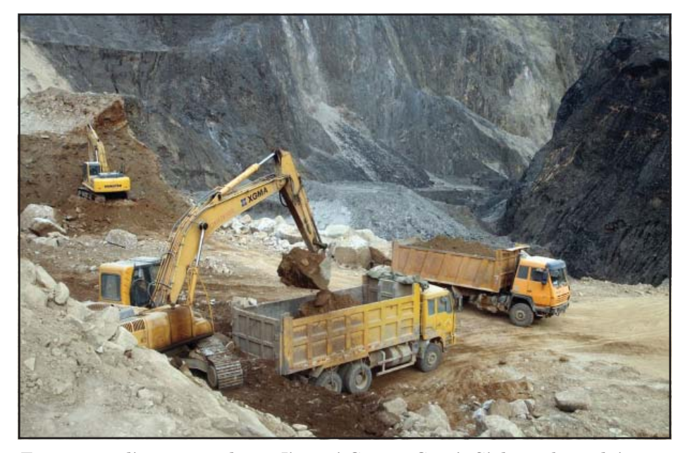
Excavators dig rare earths at Jiangxi Copper Corp's Sichuan branch in Chengdu, Sichuan Province of China.

2005 : China attempts to acquire Molycorp, the only US producer of rare earths, but the deal is stopped by US regulators.