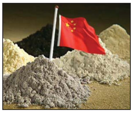
Small amounts of rare earths are essential to providing certain high-tech attributes to more common materials.