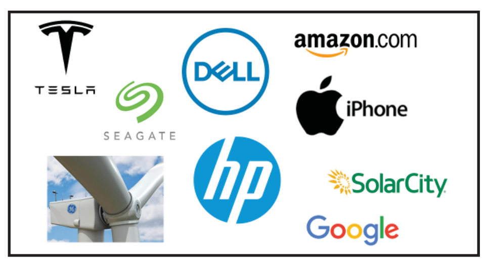
These are just a few of the high tech companies relying on environmentally destructive mining practices in China to get the critical minerals they need to manufacture their products.

Shelby Wood, writing in, stated, "The inky smoke belched by chimneys in Chinese cities such as Linfen and Datong contains mercury, a metal