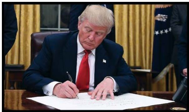
Recognizing America's vulnerability to China's monopoly on critical minerals, President Trump signed Executive Order #13817 on December 20, 2017.

Current permitting schemes can take ten years, fifteen years, or even longer for a mining company to get from explo-