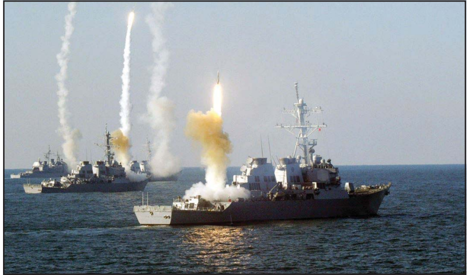
April 2017: American warships fire Tomahawk missiles on a Syrian airbase in retaliation for chemical attacks on their own people.

Cobalt is a required alloy for aircraft engines, electronic devices,