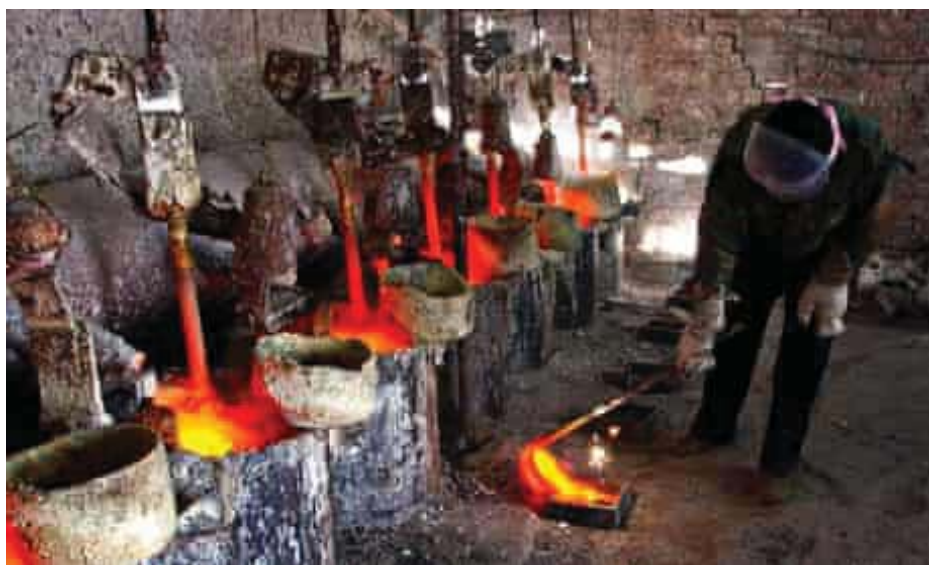
A worker pours rare earth metal lanthanum into a mould near the town of Damao, in China's Inner Mongolia Autonomous Region.

Even as America tightens emission standards, the fast-growing economies of Asia are filling the air