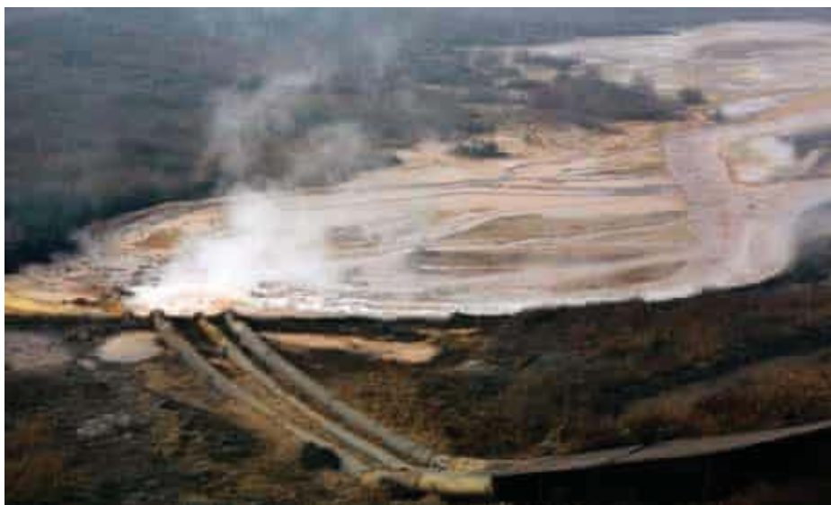
Pipes coming from a rare-earth smelting plant spew into a tailings dam on the outskirts of Baotou in China's Inner Mongolia autonomous region.

From the air it looks like a huge lake, fed by many tributaries, but on the ground it turns out to be a murky expanse of water, in which no fish or algae can survive. The shore is coated with a black crust, so thick you can walk on it. Into this huge, 10 sq km tailings pond nearby factories discharge water loaded with chemicals