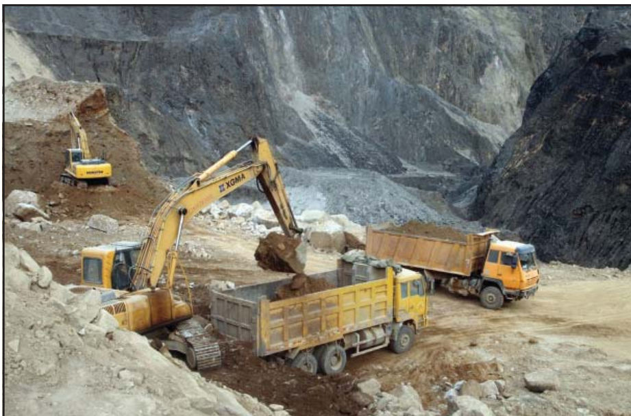
Excavators dig rare earths at Jiangxi Copper Corp’s Sichuan branch in Chengdu, Sichuan Province of China.

In 1995, China’s National Non-Ferrous Import Corporation was allowed to purchase Magnequench, a high-tech magnet manufacturer in Indiana. Three years later, the facility closed its doors. By 2003, the company was renamed and all equipment had been moved to facilities in Tianjin, China.